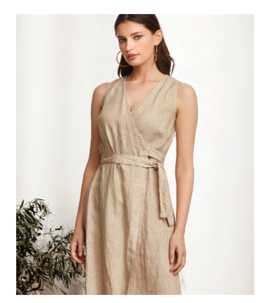
Dress 11-253 Composition: 100% linen Made in Greece Available sizes: S M L XL 2XL