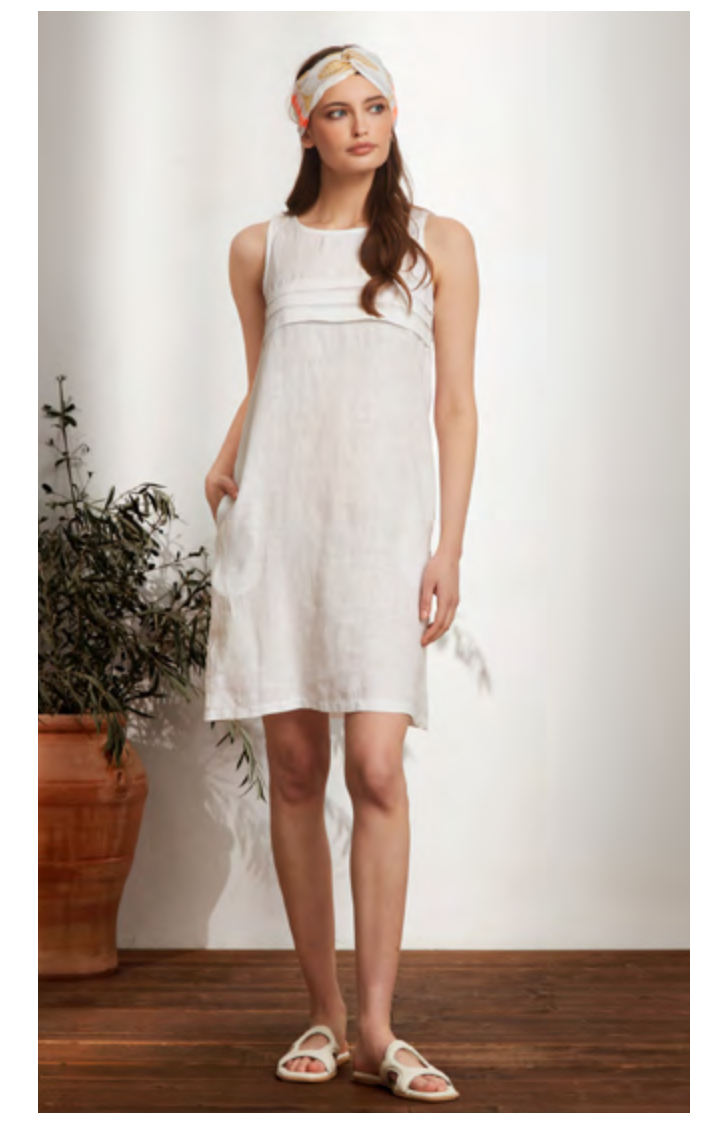
Dress 11-311 Composition: 100% linen Made in Greece Available sizes :