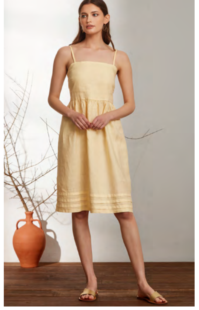
Dress 11-18 Composition: 100% linen Made in Greece Available sizes: