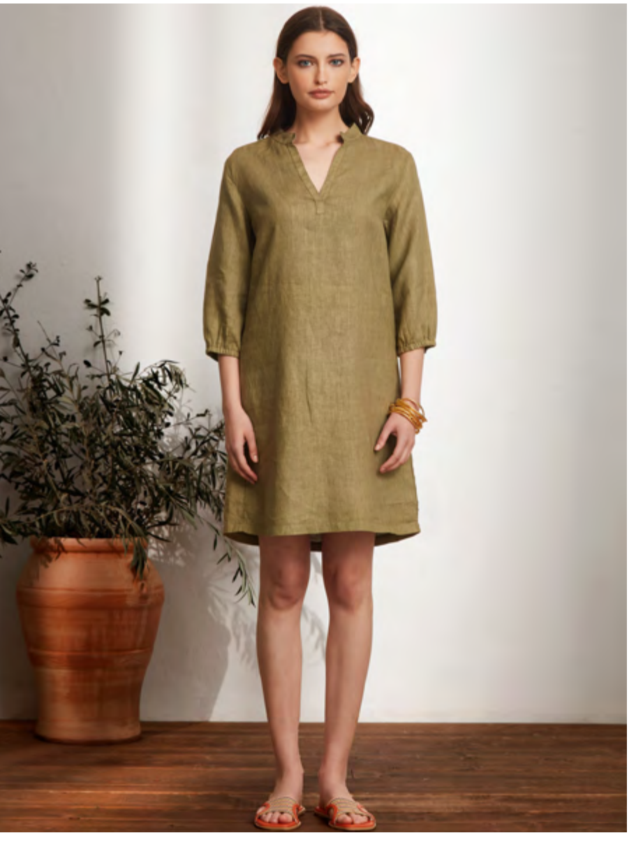
Dress 11-332 Composition: 100% linen Made in Greece Available sizes: S M L XL 2XL