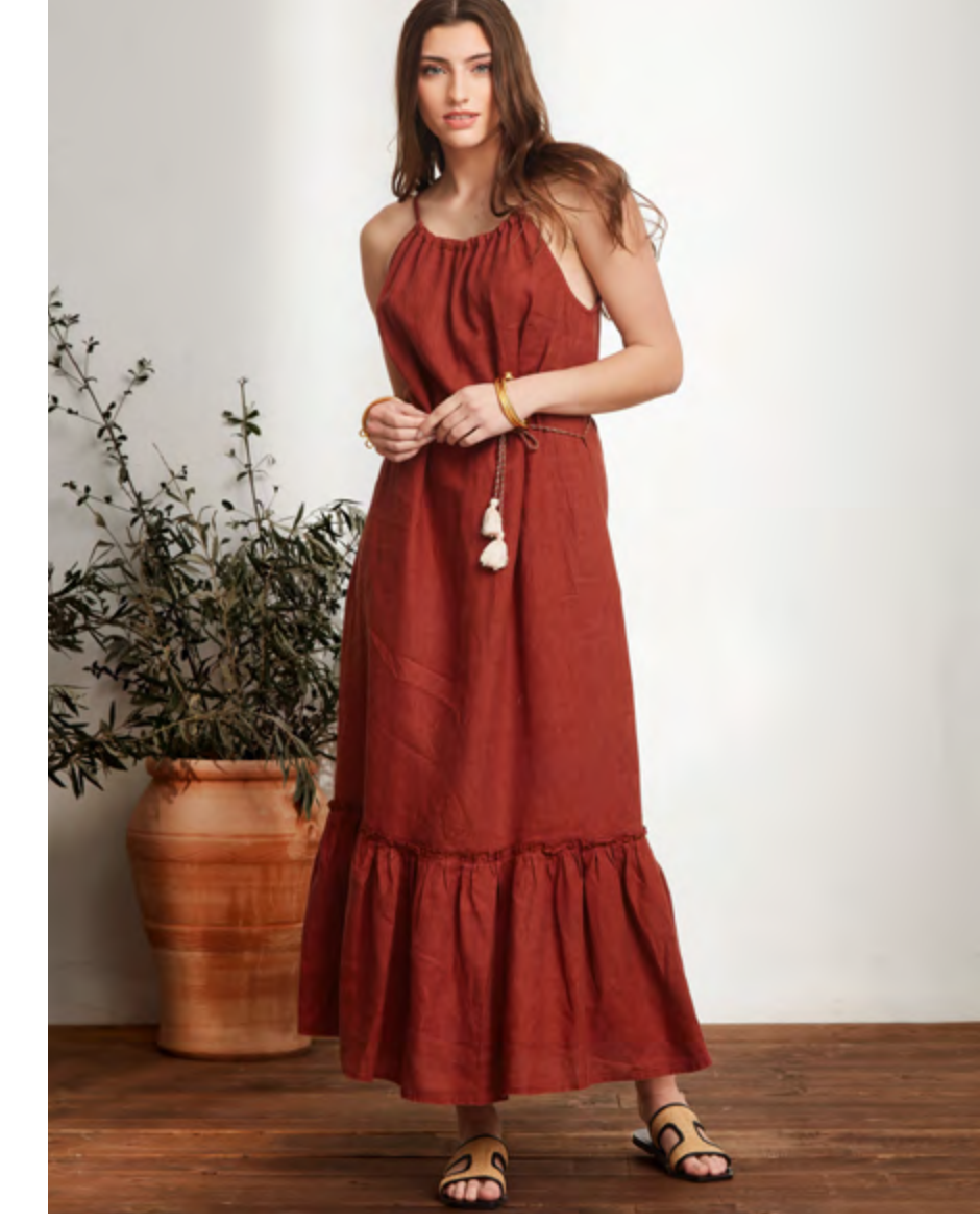
Dress 11-321 Composition: 100% linen Made in Greece Available sizes : S M L XL 2XL