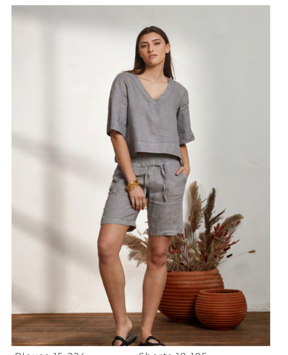
Blouse 15-224 Composition: 100% linen Made in Greece Available sizes: S M L XL 2XL