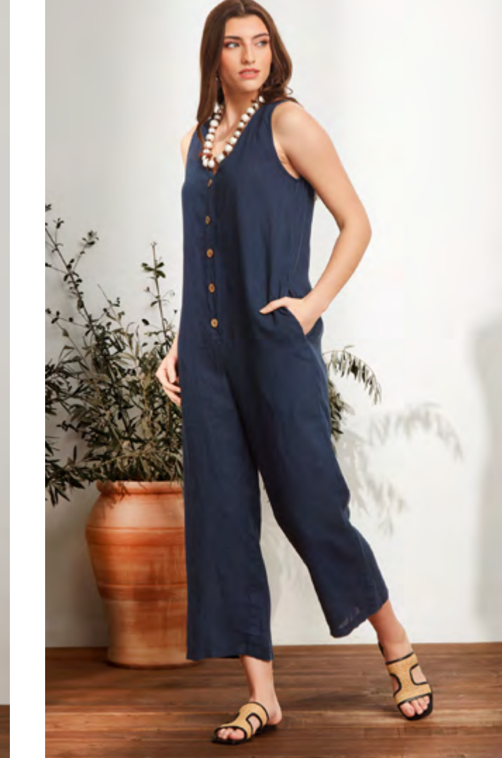
Jumpsuit 11-337 Composition: 100% linen Made in Greece Available sizes : S M L XL 2XL