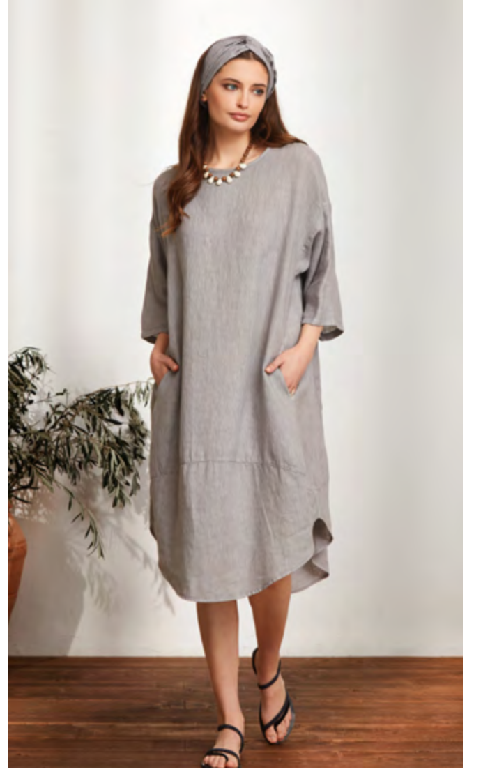
Dress 11-317 Composition: 100% linen Made in Greece Available sizes : S/M M/L L/XL