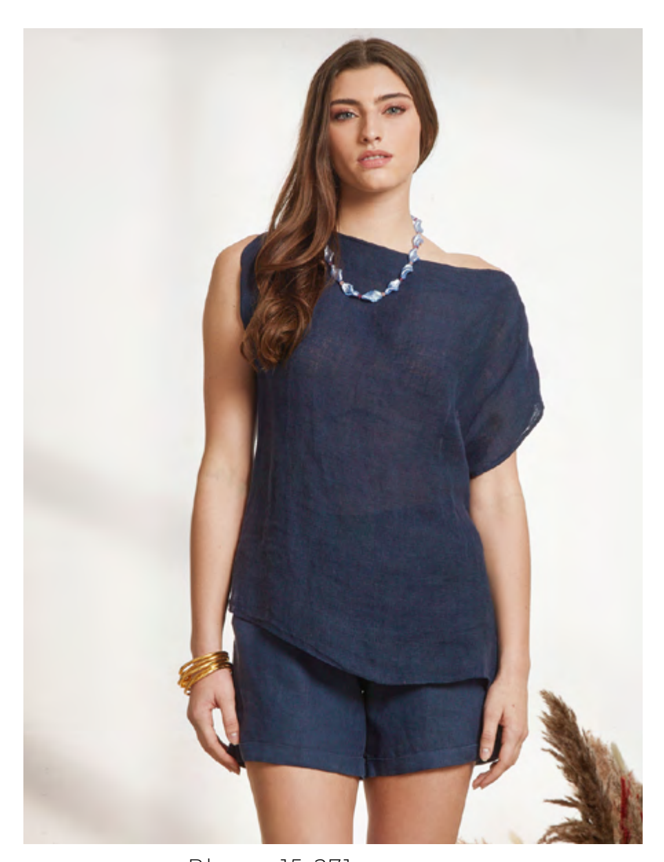
Blouse 15-271 Composition: 100% linen Made in Greece Available sizes : S M L XL 2XL