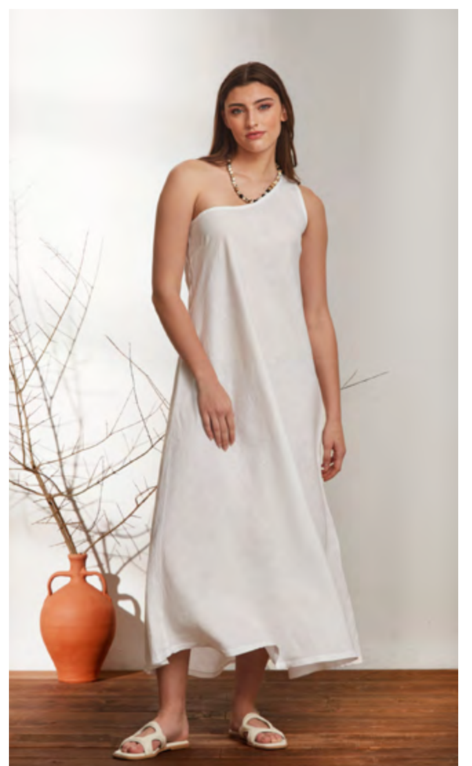
Dress 11-324 Composition: 100% linen Made in Greece Available sizes : S M L XL 2XL