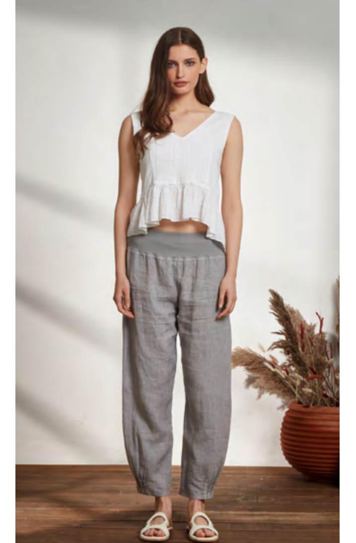
Pants 13-110 Composition: 100% linen Made in Greece Available sizes: S/M M/L L/XL