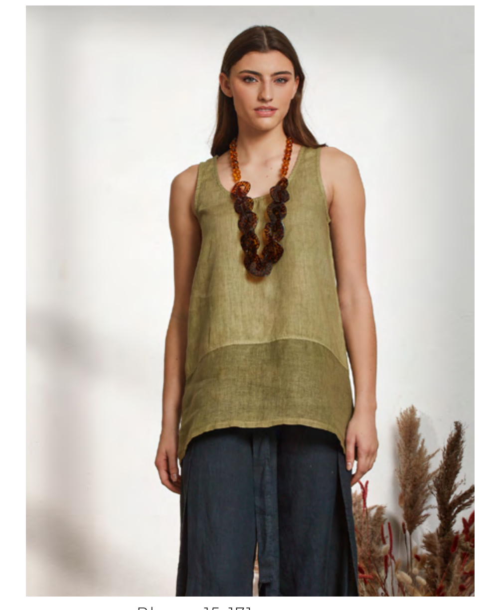
Blouse 15-171 Composition: 100% linen Made in Greece Available sizes : S M L XL 2XL