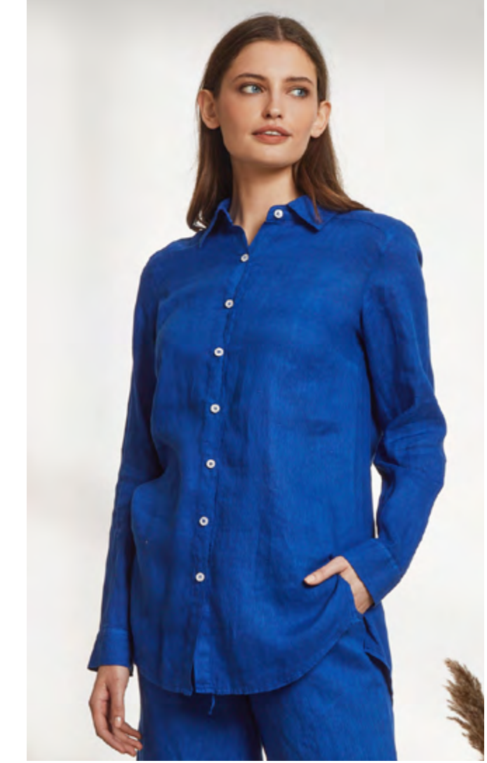
Shirt 14-10 Composition: 100% linen Made in Greece Available sizes: