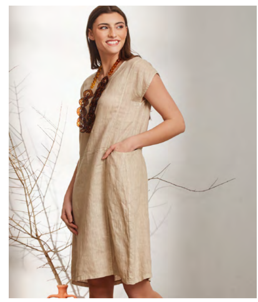
Dress 11-225 Composition: 100% linen Made in Greece Available sizes: S/M M/L L/XL