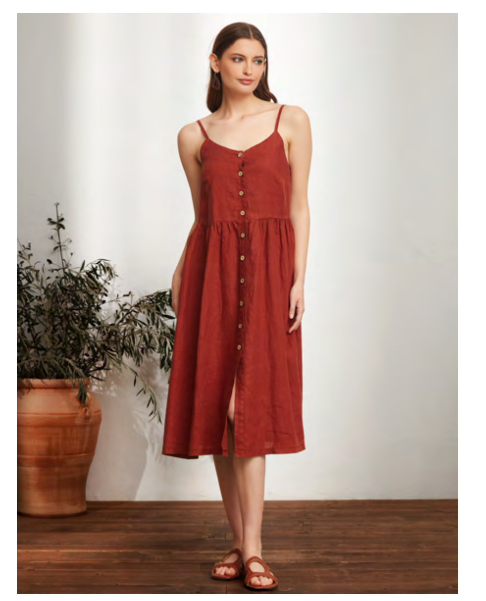
Dress 11-334 Composition: 100% linen Made in Greece Available sizes: S M L XL 2XL