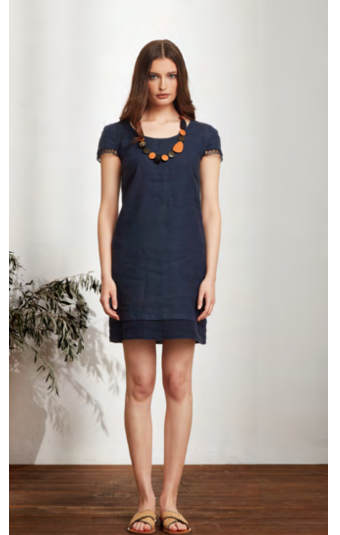
Dress 11-278 Composition: 100% linen Made in Greece Available sizes: S M L XL 2XL