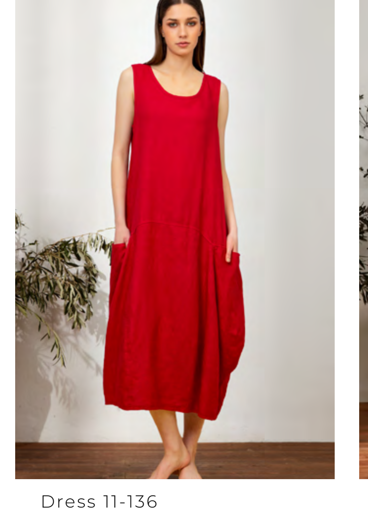
Composition: 100% linen Made in Greece Available sizes : S/M M/L L/XL