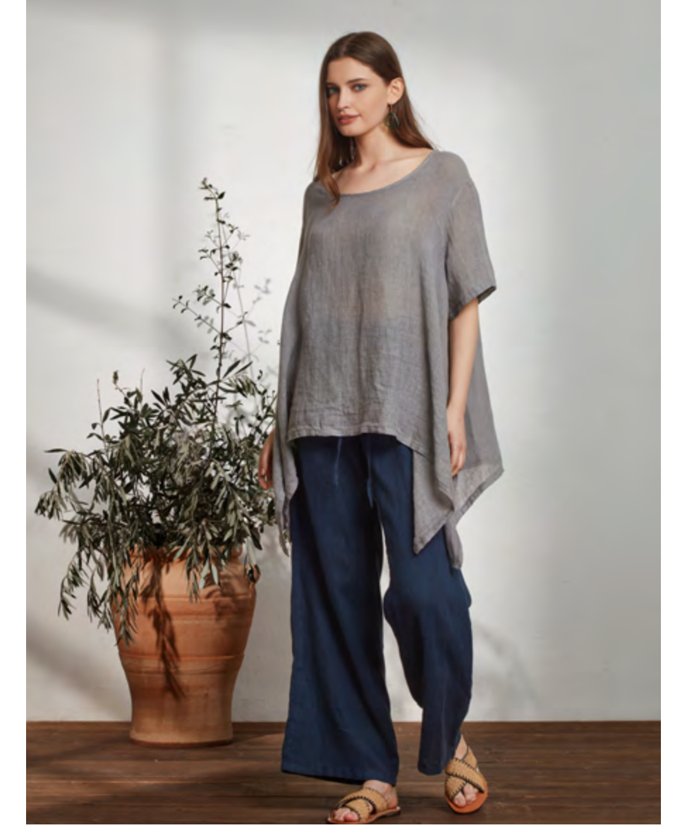
Blouse 15-124 Composition: 100% linen Made in Greece Available sizes : os